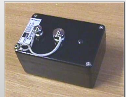
IP-68 Single Input Dual channel Sentry Solo